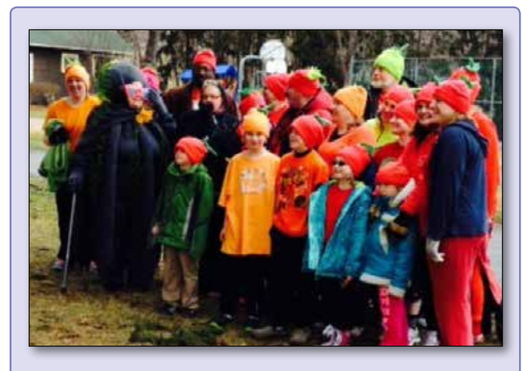
BRAVE POLAR PLUNGE FRIENDS RAISE FUNDS FOR HAPPINESS HOUSE