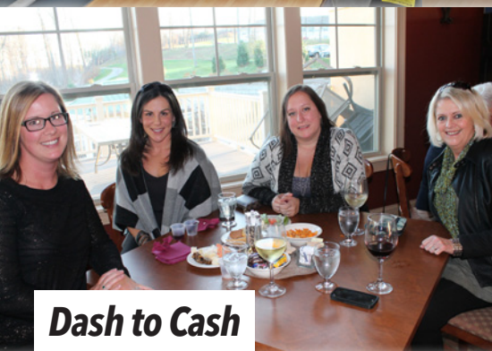
Dash to Cash