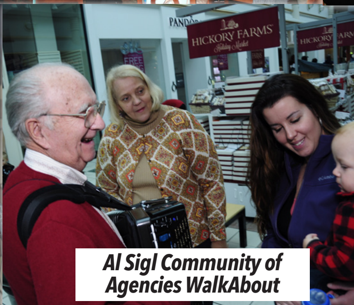
Al Sigi Community of Agencies WalkAbout