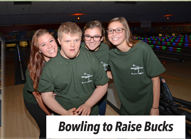
Bowling to Raise Bucks