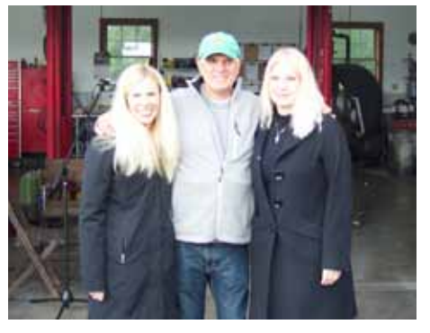
Happiness House Car Show Sponsored by Geneva Foreign & Sports